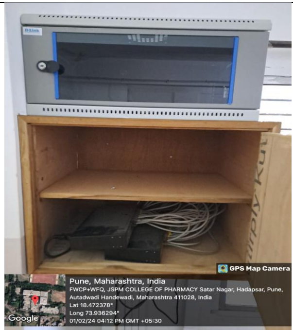
Pune, Maharashtra, India FWCP+WFQ, JSPM COLLEGE OF PHARMACY Satar Nagar, Hada Autadwadi Handewadi, Maharashtra 411028, India Lat 18.472378° Long 73.936294° 01/02/24 04:12 PM GMT +05:30