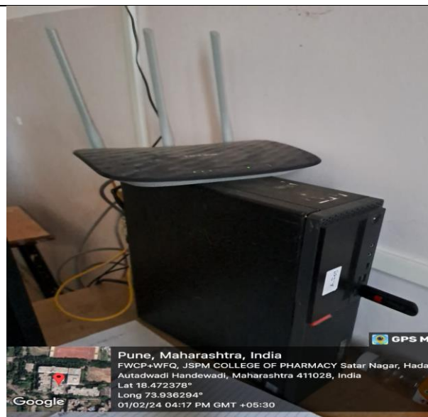
Pune, Maharashtra, India FWCP+WFQ, JSPM COLLEGE OF PHARMACY Satar Nagar, Hada Autadwadi Handewadi, Maharashtra 411028, India Lat 18.472378° Long 73.936294° 01/02/24 04:17 PM GMT +05:30