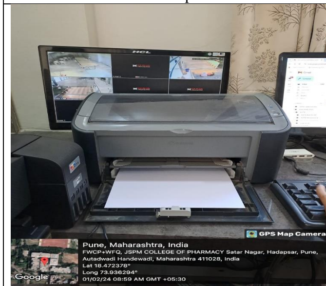
Pune, Maharashtra, India FWCP+WFQ, JSPM COLLEGE OF PHARMACY Satar Nagar, Hada Autadwadi Handewadi, Maharashtra 411028, India Lat 18.472378° Long 73.936294° 01/02/24 08:59 AM GMT +05:30